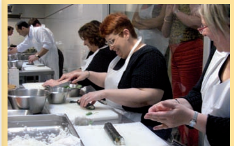
Technical Committee members in Paris, taking time out to cook together

The GFSI is in discussion with a number of regional and international bodies based in Europe including the WTO, UNIDO and the European Commission. Discussions have raised awareness on food safety standards in the private sector